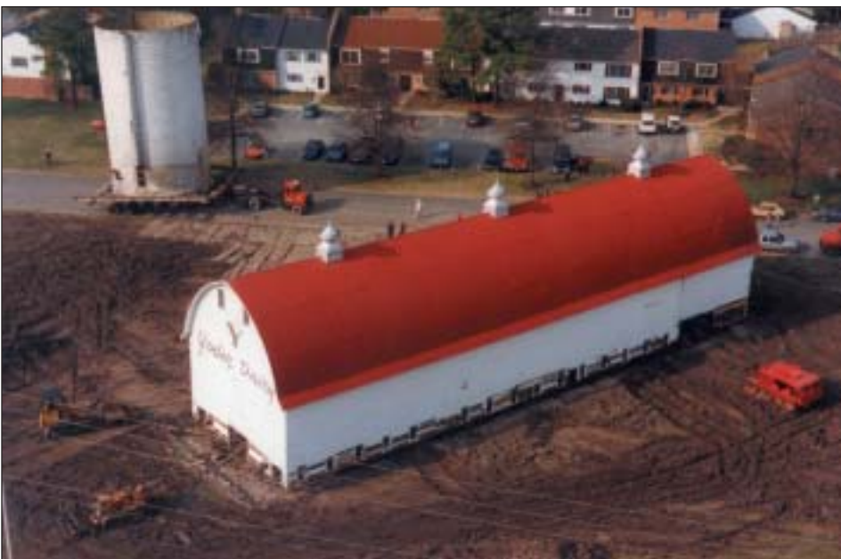
Barn in Newport News, Virginia in 1998.