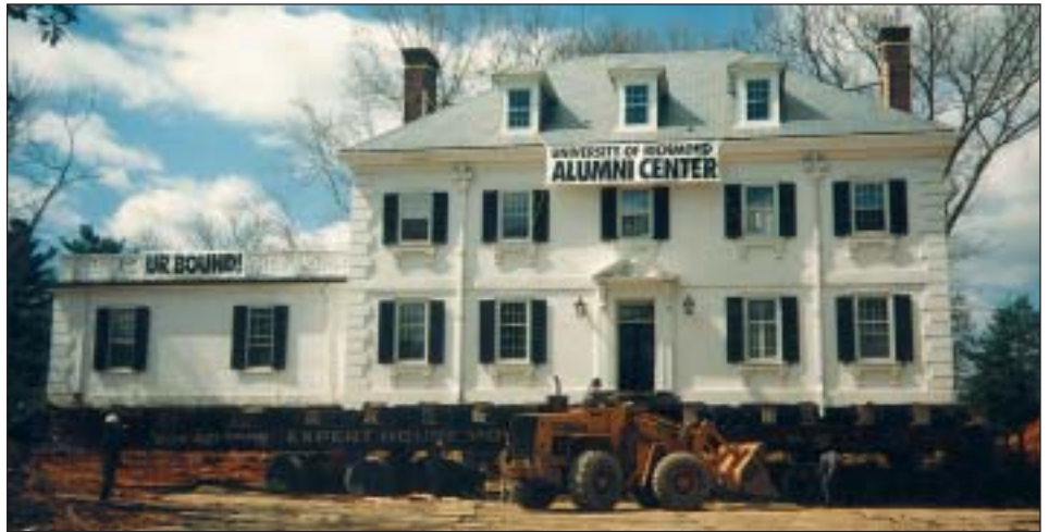
Alumni Center at the University of Richmond, Virginia in 1999.