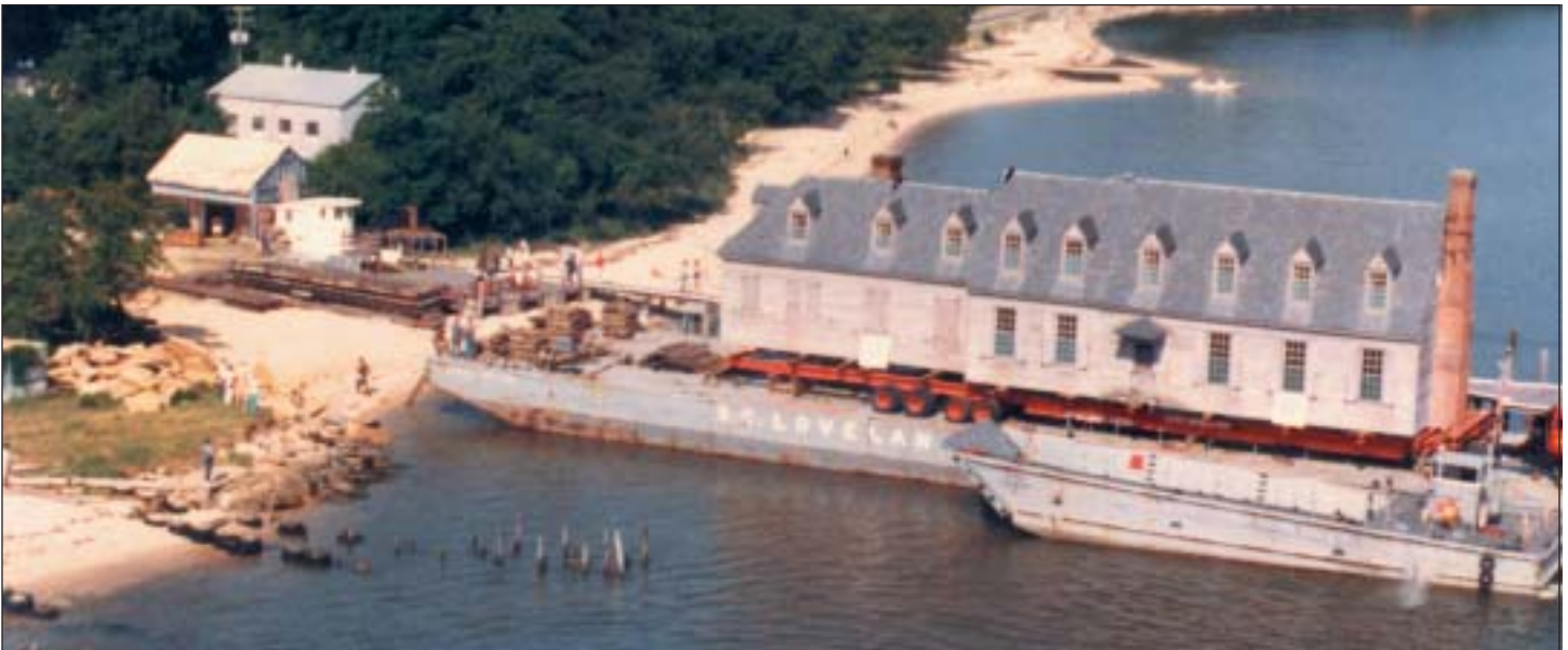
The Waterman Museum was moved in Yorktown, Virginia in 1980.