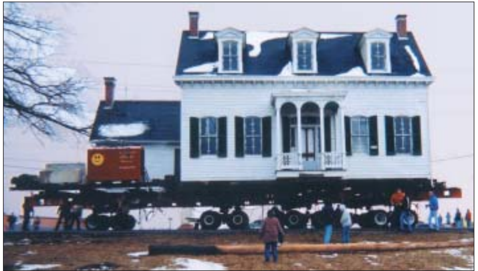
Wooden structure in St Louis, Missouri in 2000.