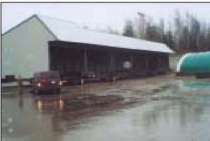
A "L" extension was 40' x 24'.