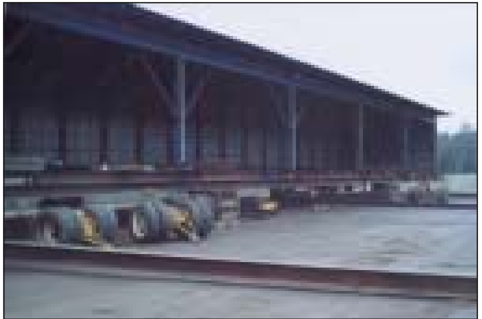
The structure had seven steel uprights on the front.