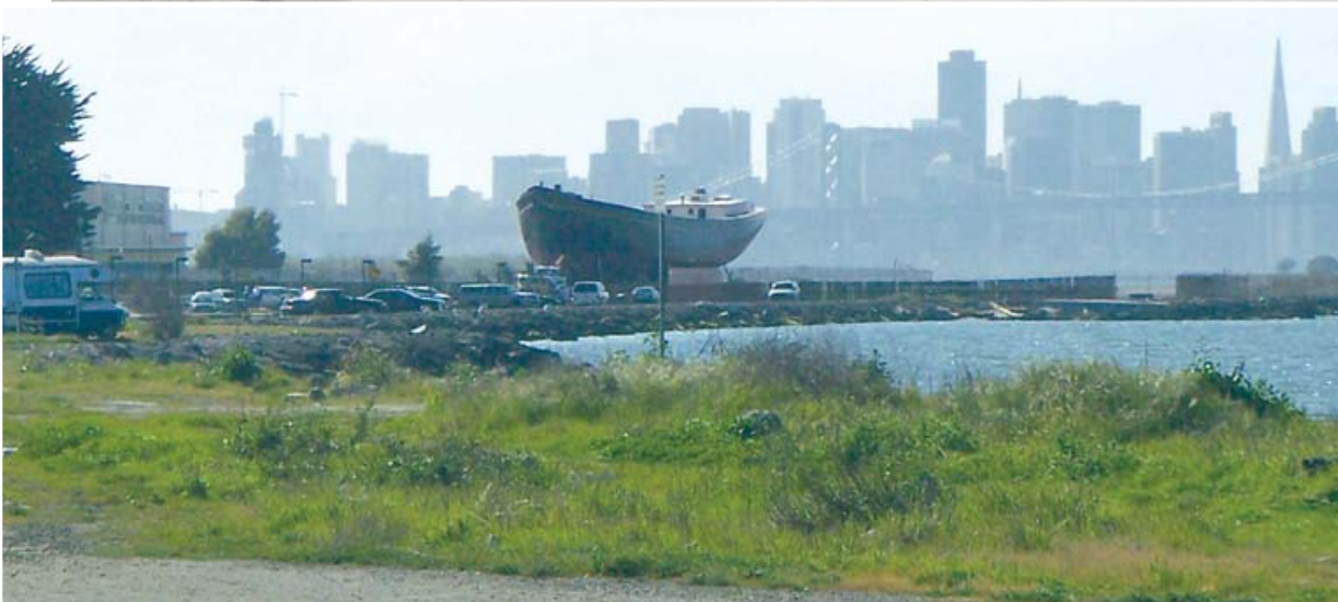
San Francisco Skyline looms in the background.