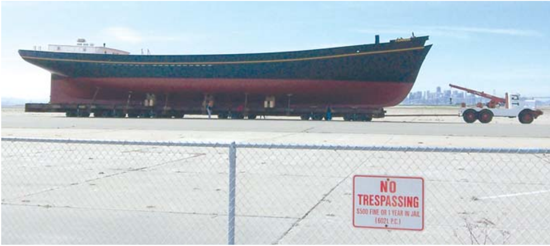
Leaving the now closed Alameda Air Station.