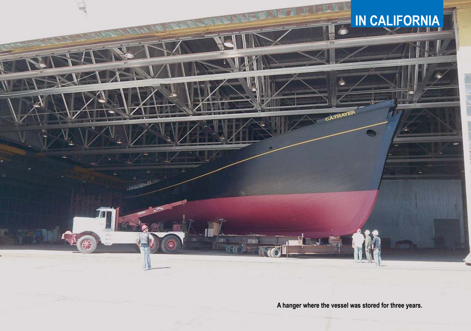
A hanger where the vessel was stored for three years.