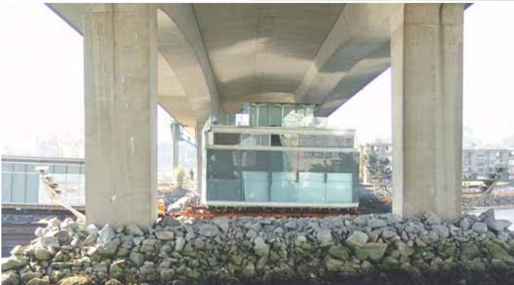
(left) Passage under the bridge was made possible by waiting for low tide.