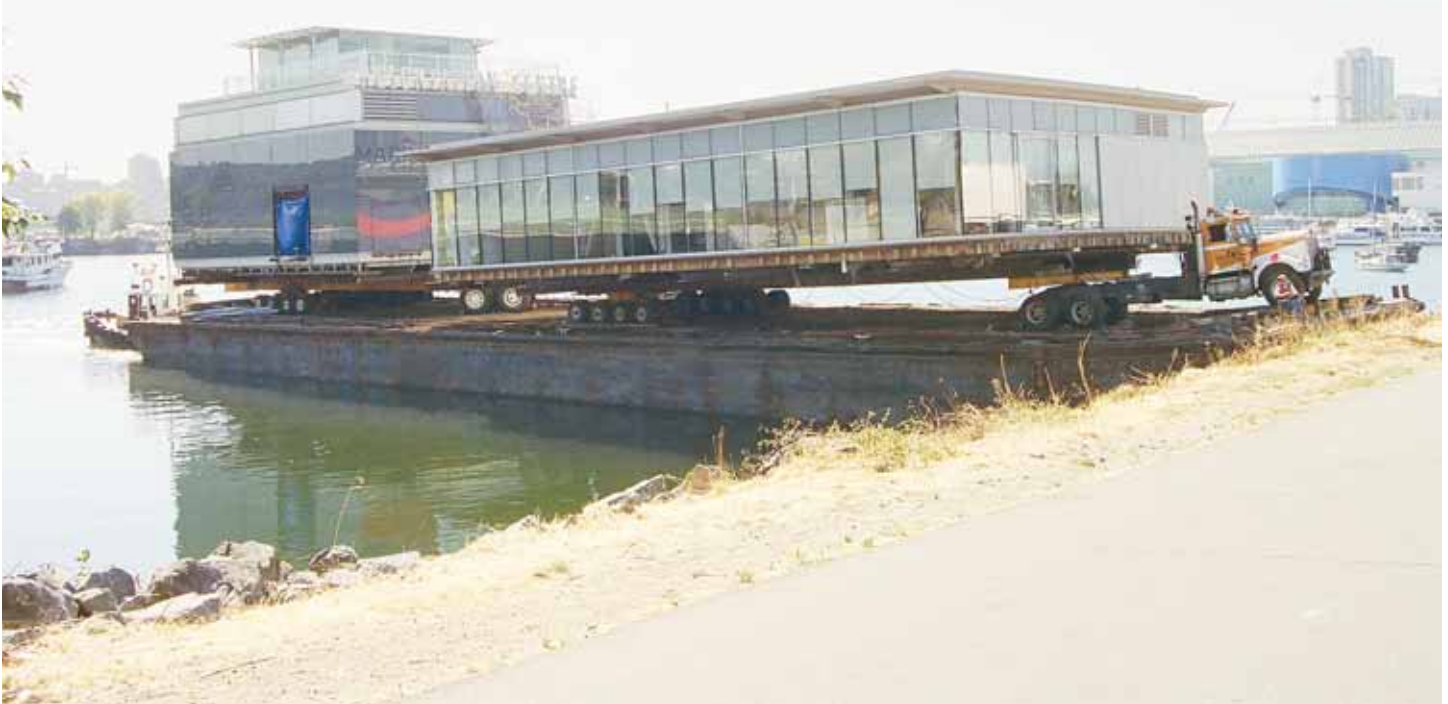
(Below) Later the same day, the structures were off loaded at the end of False Creek by waiting approximately six hours for a high tide.