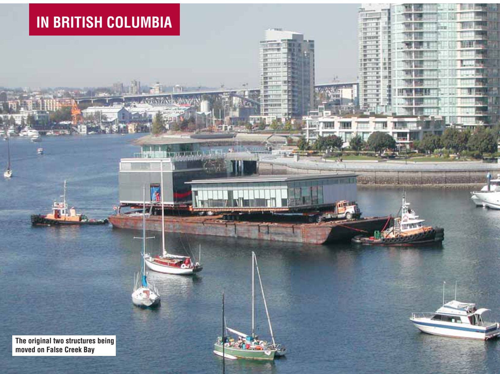
The original two structures being moved on False Creek Bay