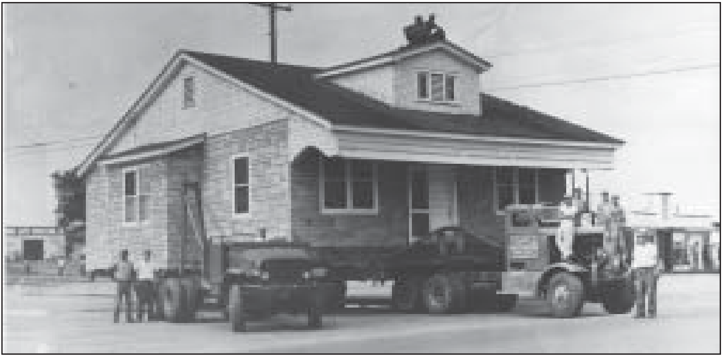
An early move by the fledging Oswald company