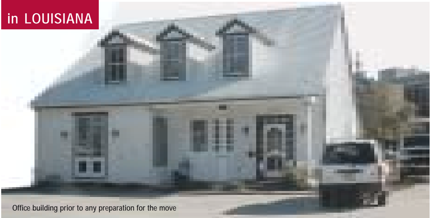
Office building prior to any preparation for the move