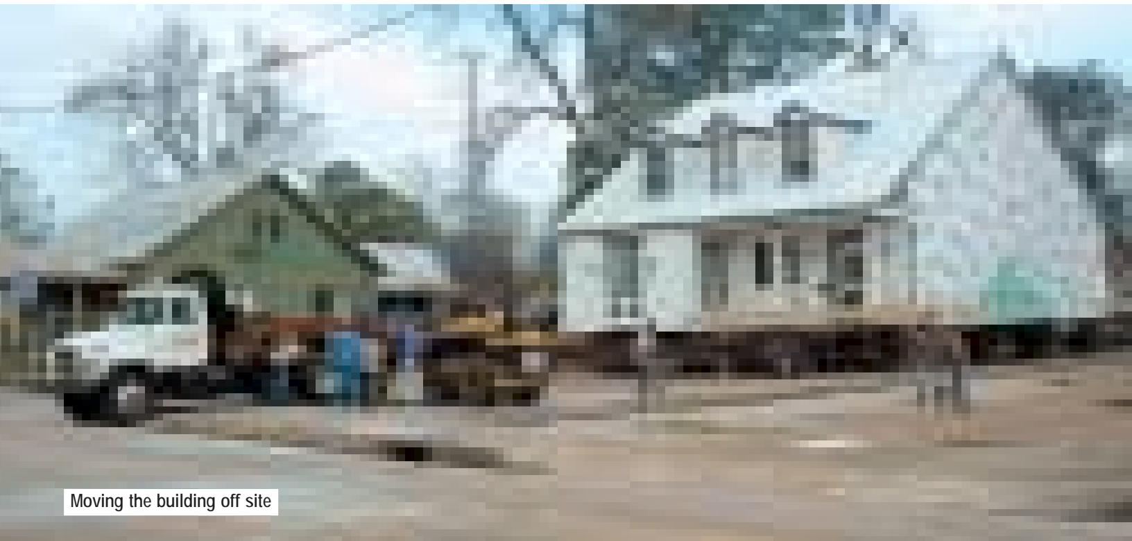
Moving the building off site